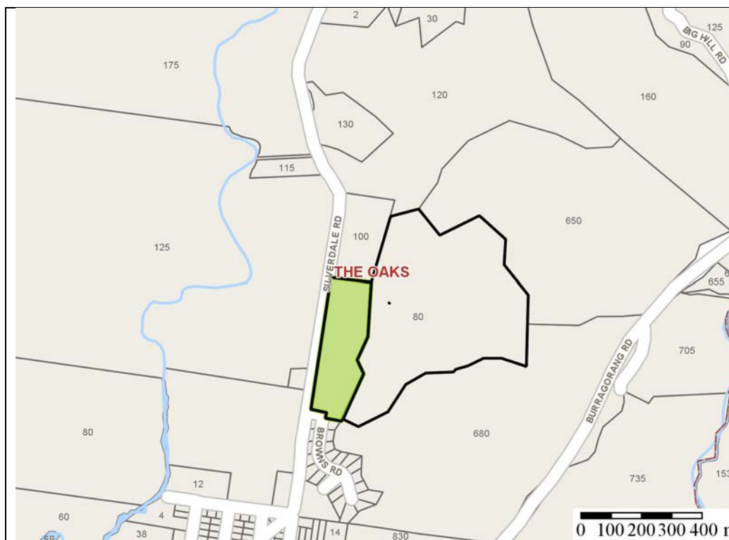
LOCATION MAP ↑ N